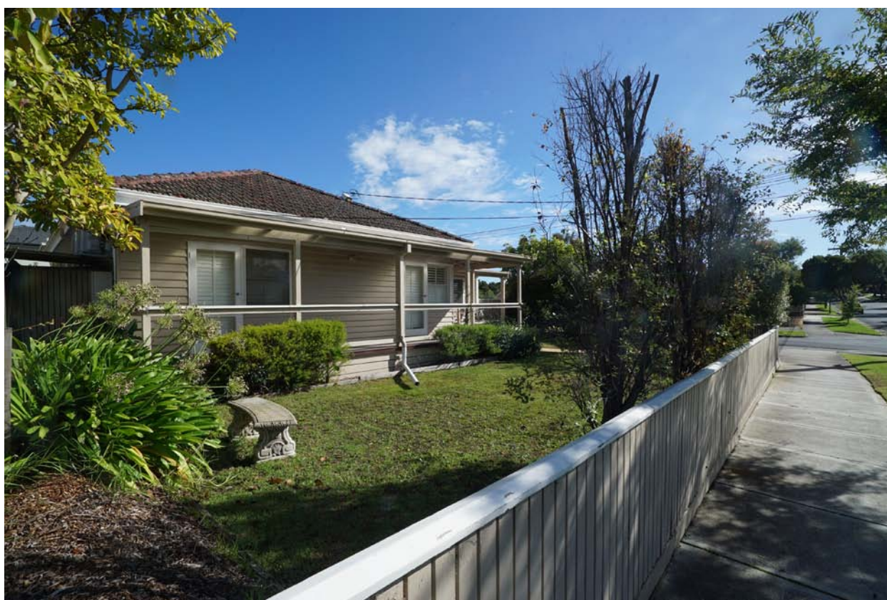
Figure 2: Photograph of temporary pipework at Mr Wilson's house